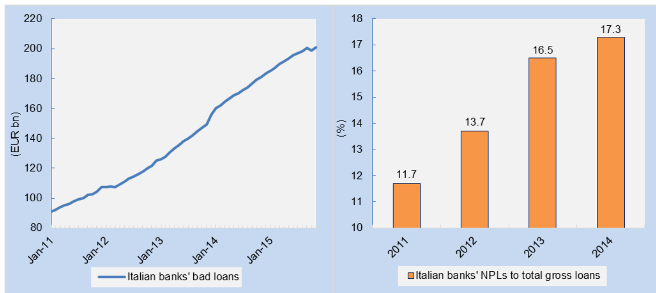
Figure 1: Italian banks' bad loans on the left panel; Italian banks NPLs to total gross loans on the right panel.

Italian banks had a rocky start to the year as the European Central Bank (ECB) tightened scrutiny over banks' Non-Performing Loans (NPLs), elevating investors' concerns over the asset quality of Italian banks. Bad debts taking a toll on Italian banks are not a recent problem, but more like a ticking time bomb that has been accumulating over the years, and may potentially explode in the near future.